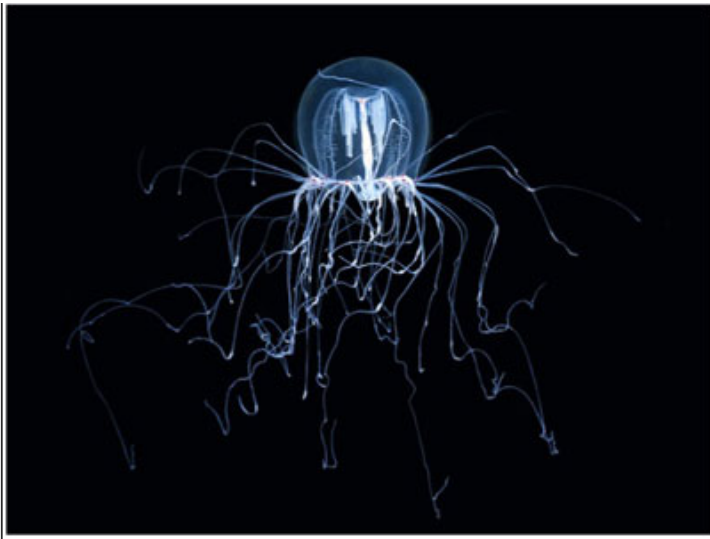
2 nd Place – Trevor Rees – Red Eye Medusa from Vancouver Island with 3 votes

3 rd Place – Peter Plume – Male Anthias with 2 votes