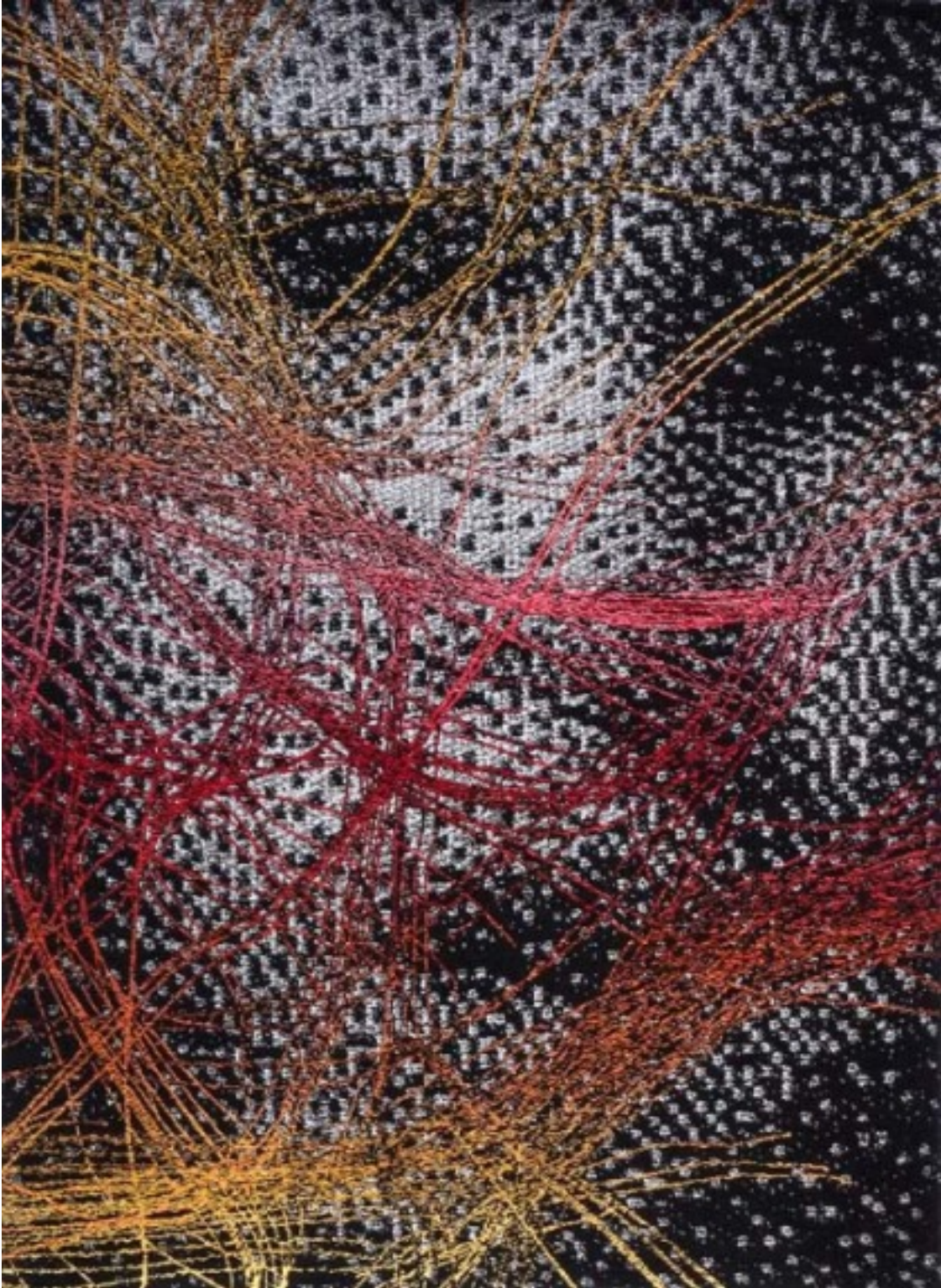
Su Brain Tracts Renew by Lia Cook, 2014, woven cotton and rayon