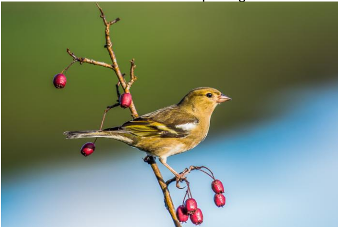
"Sitting Pretty" by Frank McCollum

In the Intermediate class the top image was: