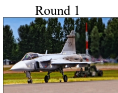
1 Jet Plane-M01.jpg