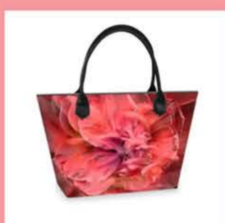
New Limited Edition Tote Bag

For the first time this June I shall be at the Spirit of Summer Fair at Olympia, London on stand D71. I will be showing my latest artworks, scarves and bags. Click on the link to find out more Spirit of Summer link..