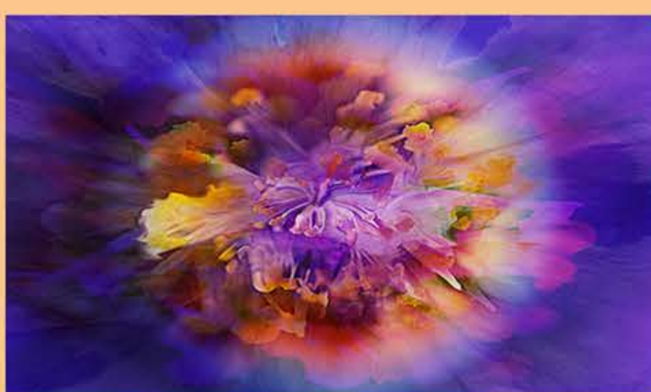
In Paradisum III

This year I am introducing artworks on Perspex in a rectangular format I will be showcasing them at Grand Designs Live and The Spirit of Summer Fair.