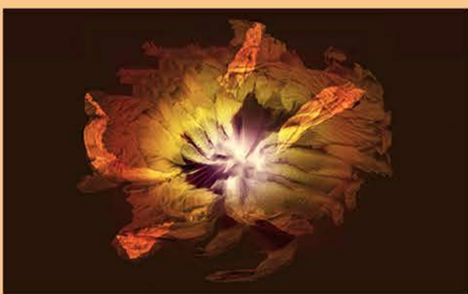
Oiseau Bleu III