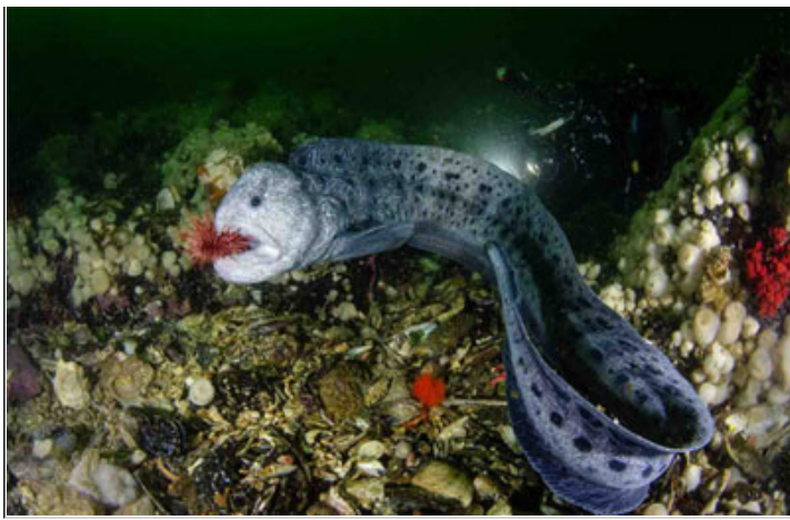
Arthur Kingdon with a shot of a Wolfeel from Fantasy Island, in Canada.