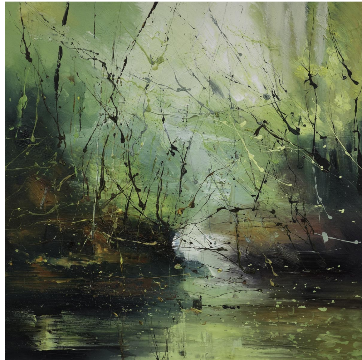
CAT NO.8 ABSORBING GREEN mixed media on canvas 24 × 24 ins (60 × 60 cm) £945