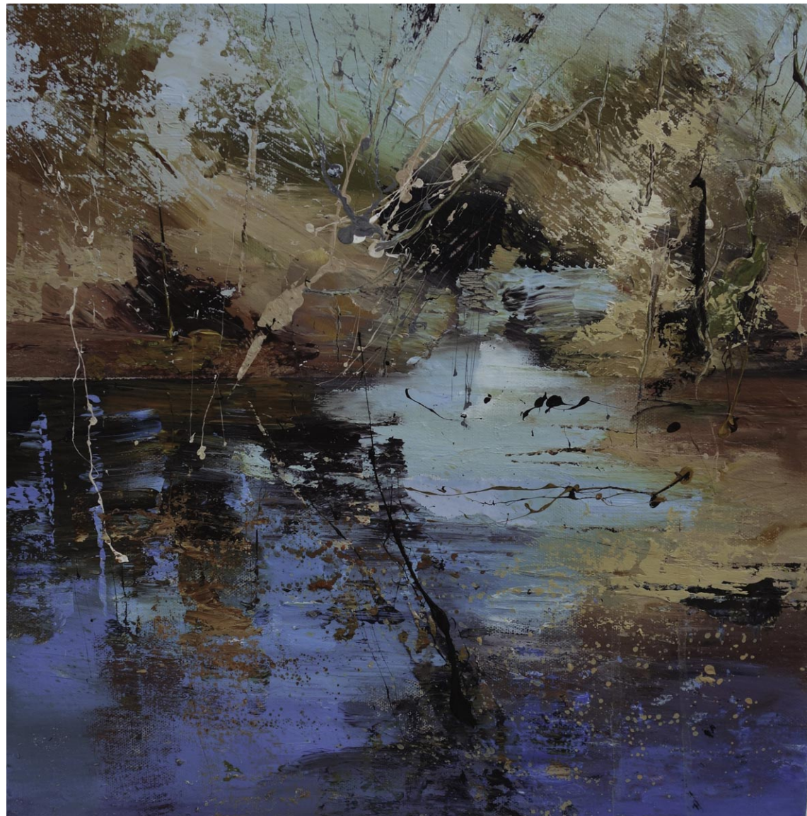
CAT NO.7 SHADOWS mixed media on canvas 16 × 16 ins (40 × 40 cm) £675