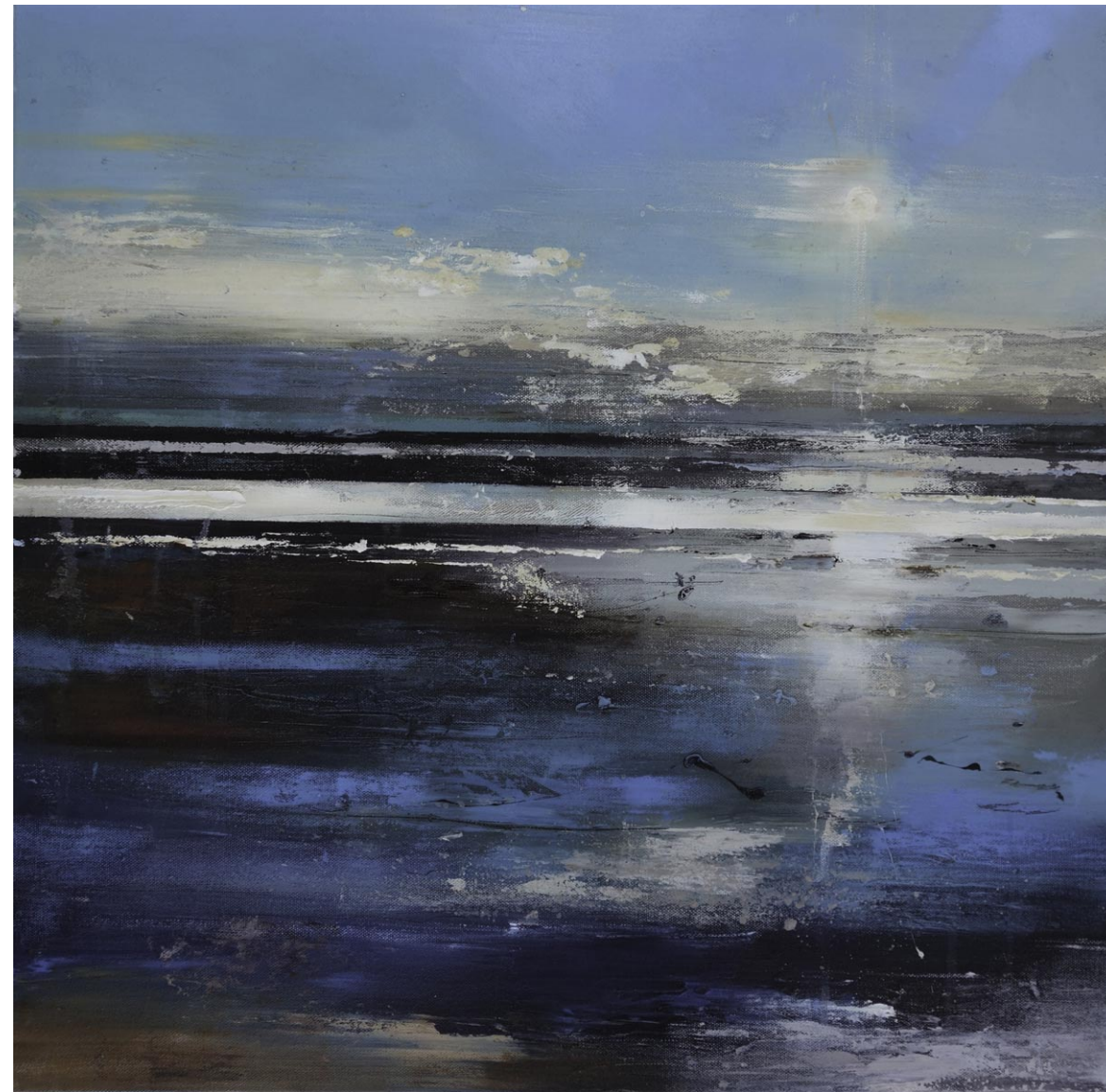
CAT NO.4 FRAGILE mixed media on canvas 24 × 24 ins (60 × 60 cm) £945