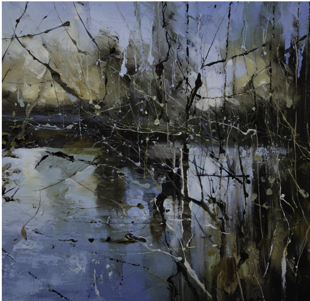
CAT NO.2 RIVER WATCH mixed media on canvas 24 x 24 ins (60 x 60 cm) £945