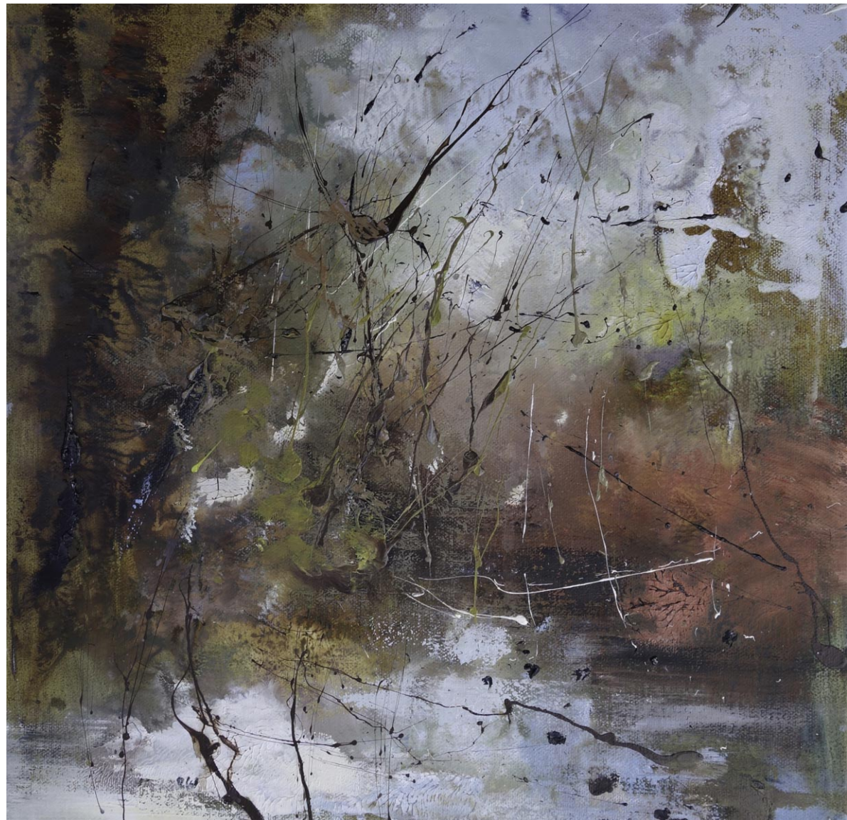
CAT NO.10 WINTER FOREST mixed media on canvas 16 × 16 ins (40 × 40 cm) £675