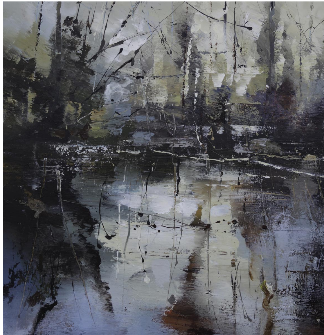
CAT NO.11 RIVER BANK mixed media on canvas 24 × 24 ins (60 × 60 cm) £945