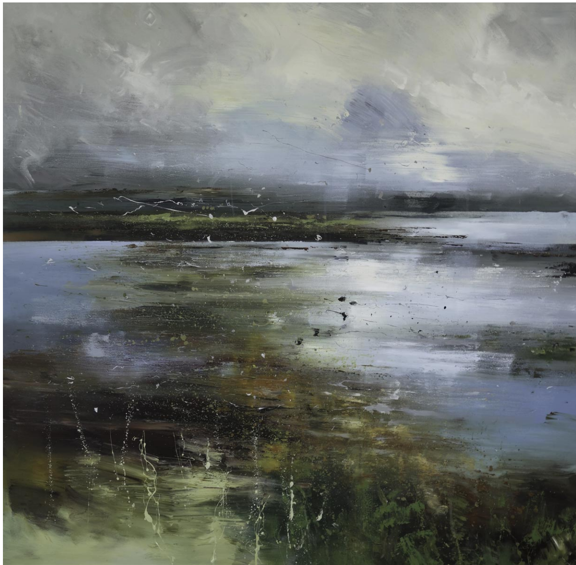
CAT NO.1 SURFACE TENSION II mixed media on canvas 39 x 39 ins (100 x 100 cm) £1,895