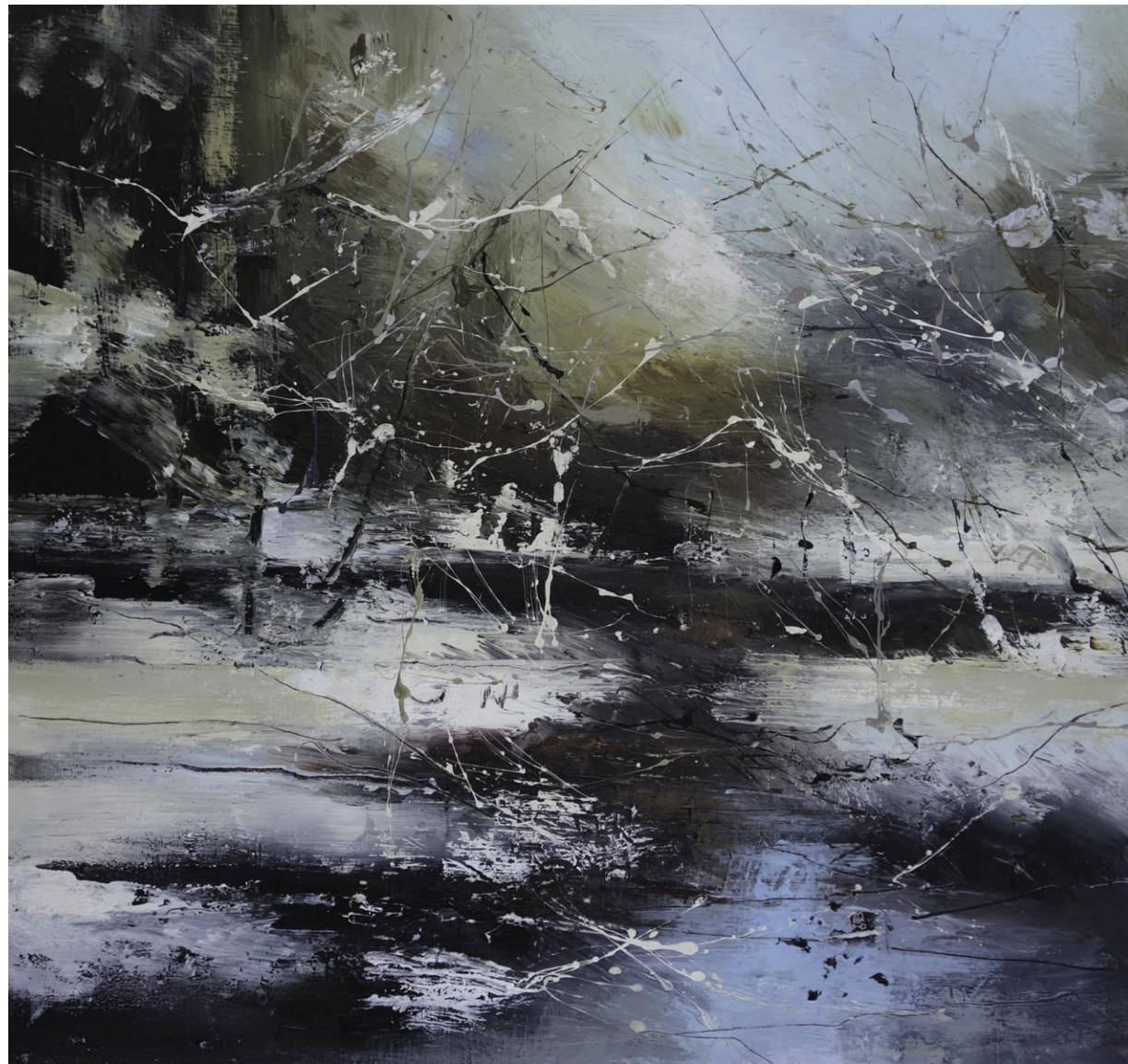
CAT NO.6 ICE TRAILS mixed media on canvas 32 x 32 ins (80 x 80 cm) £1,295