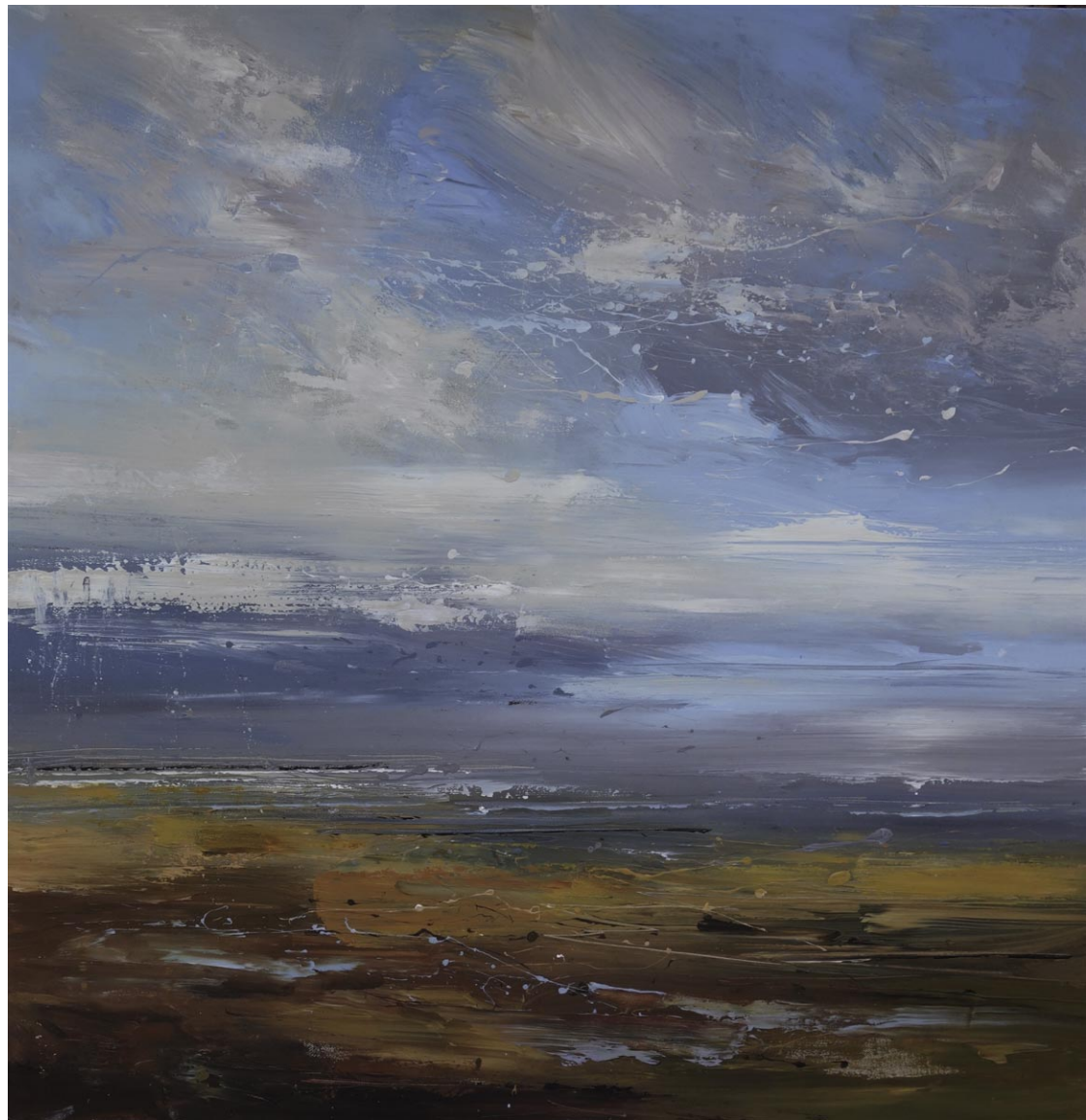
CAT NO.5 BELOW THE SURFACE mixed media on canvas 30 x 30 ins (76 x 76 cm) £1,250