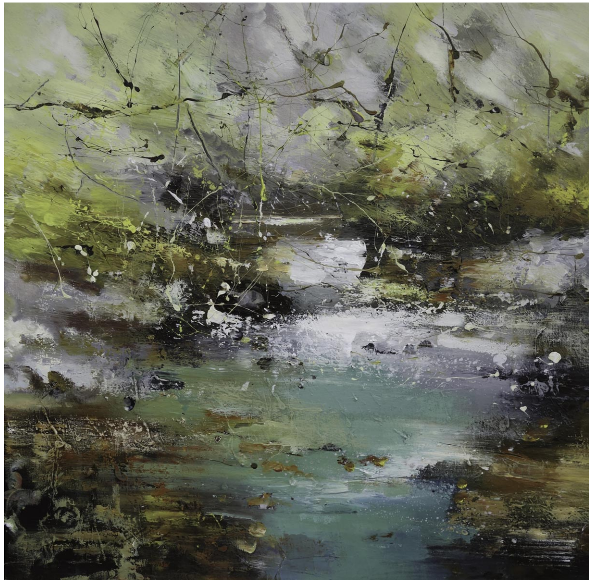
CAT NO.3 RIPPLES UNDER THE SURFACE II mixed media on canvas 30 × 30 ins (76 × 76 cm) £1,250