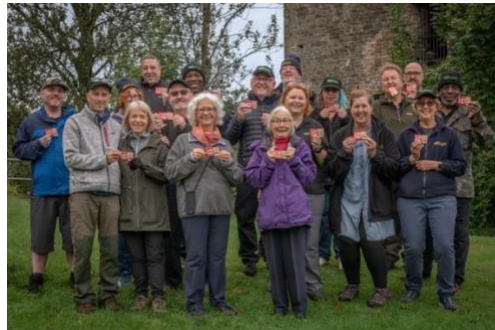
Each year we take a group photo and this is the Outlaws on tour in south Wales 2025

Over the weekend we certainly had a mix of weather conditions, on the Saturday we had a storm come through the region bringing dramatic & moody skies, however the days that followed brought crisp clear mornings & warm colourful sunsets, ideal conditions for varied photographic outcomes.