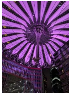
The Interior of The Sony Centre

Our first evening was in the city's modern core at Potsdamer Platz and the adjacent Sony Centre which offered a masterclass in modern architectural geometry. These structures demanded thoughtful compositions if we were to visually do them justice. The coloured lights, water fountains and grandeur of the buildings was quite breath-taking and a memorable experience for all members of the group. Following our first photoshoot and a hectic day spent travelling it was time for a social gathering and time to rest before the challenges of a new day.