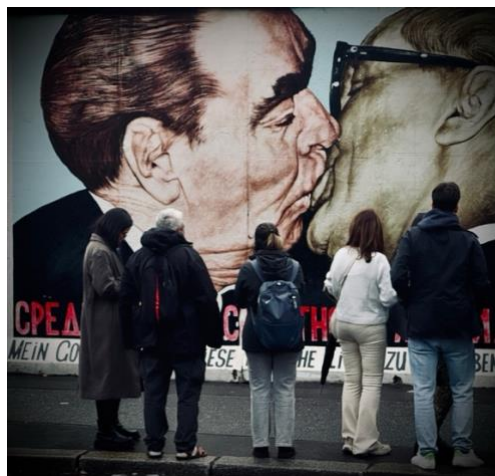
Onlookers at the Berlin Wall

The East Side Gallery alongside the river Spree offered a chance to capture people interacting with art, using the murals as a vibrant backdrop to everyday conversations and reactions. The key here was patience, waiting for the perfect moment when a subject's posture complemented the surrounding graffiti.