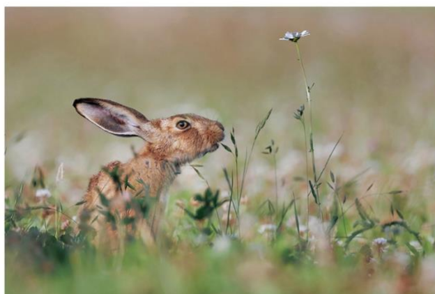
HARE IN FLOWER MEADOW - CARON SWINSCOE