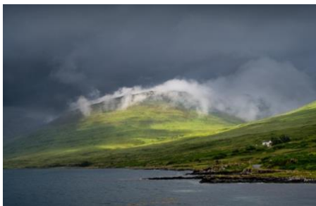
Jayne Winter FRPS

Features in Amateur Photographer's "Best Exhibitions"