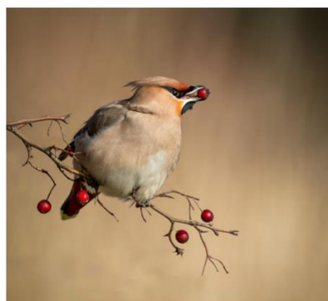
WAXWING WITH RED BERRY - NIGEL STEWART