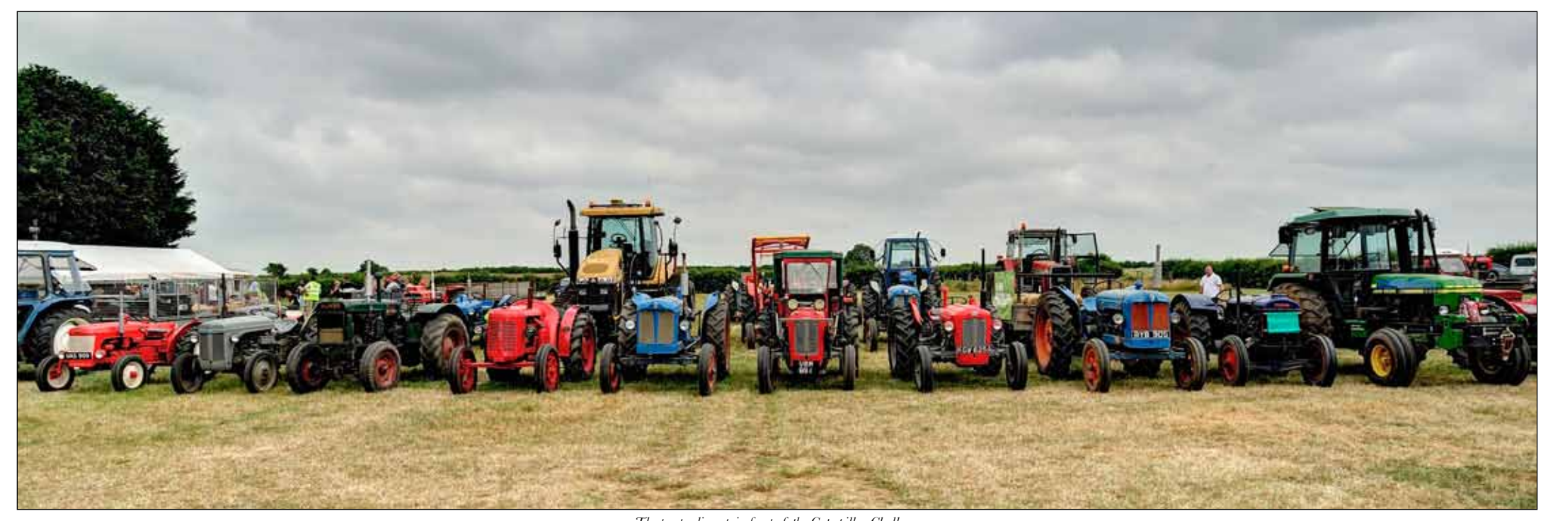
The tractor line up in front of the Caterpillar Challenge