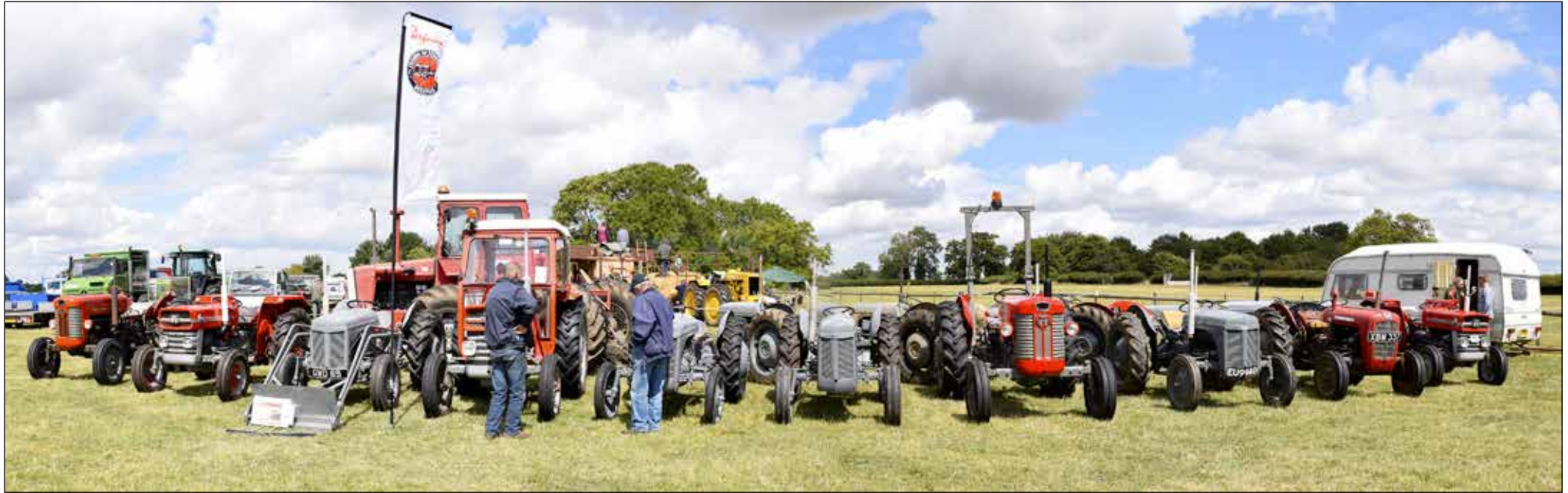
The tractor theme for this year's Blakesley Show was Massey Ferguson & Friends of the Ferguson Heritage displayed great a collection of them