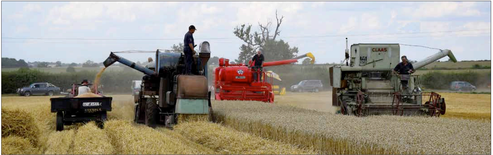
All three vintage combine harvesters produced by the Gent family worked all day Saturday with all other machinery bailing and grinding as done in years gone by