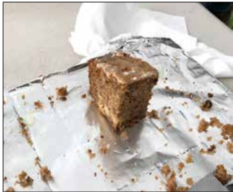
'Yes I did have the last bit of cake!'