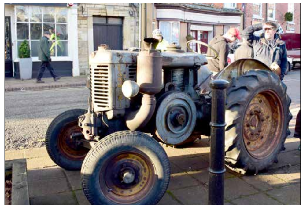
Jeremy Vick's 1956 Landini L25. Hot Bulb start with a Single cylinder two stroke diesel engine