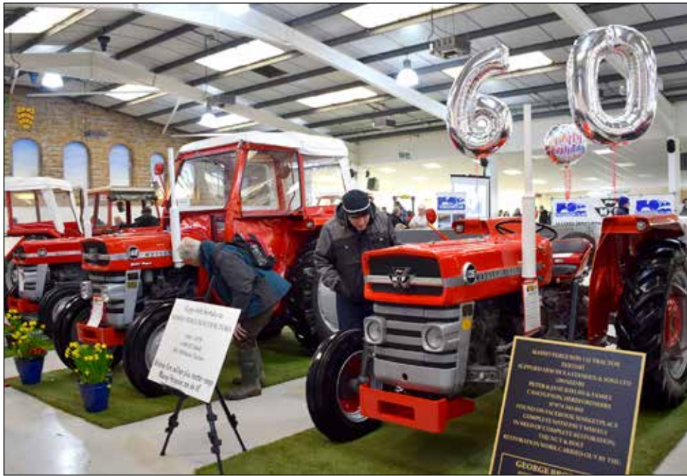
The Massey Ferguson display inside the Avon Hall was impressive and interesting