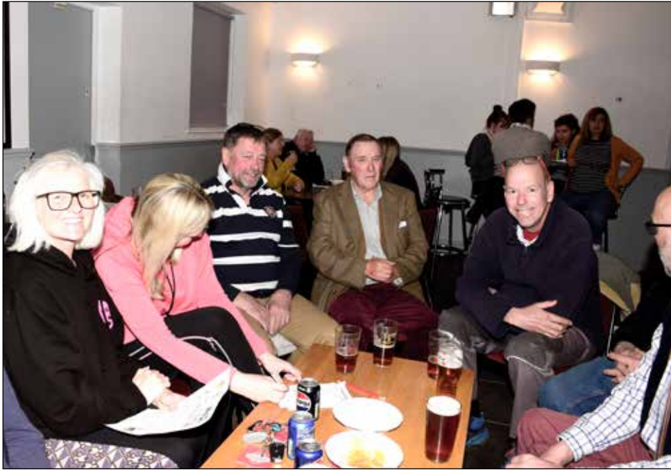
Winners were 'Cranfield Tractor lads'