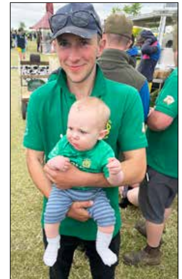
Tug of War - captured by Graham Night from Ruralshots. For more information and more photos visit his website: www.ruralshots.com