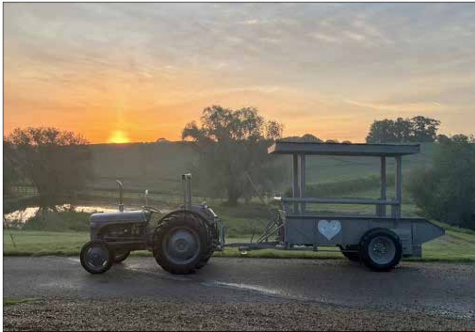
Sun just coming up