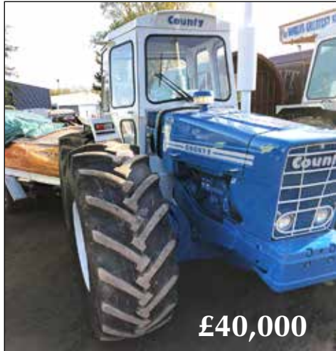
Cheffins Spring Sale 24th April 2024 words & photos Peter Godwin (also Cheffins site)

The Cheffins Spring Vintage Sale although not very spring like weather certainly provided for a very interesting day. The trend away from early hand crank start tractors continues with a general weakening of prices.