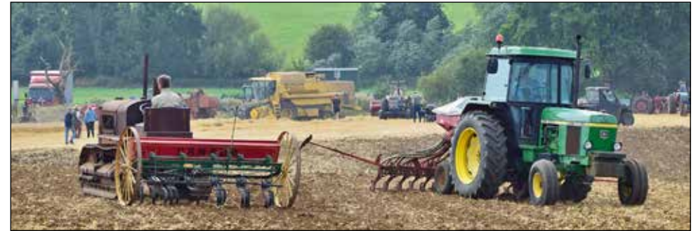
There were various machines working on the fields around the farm