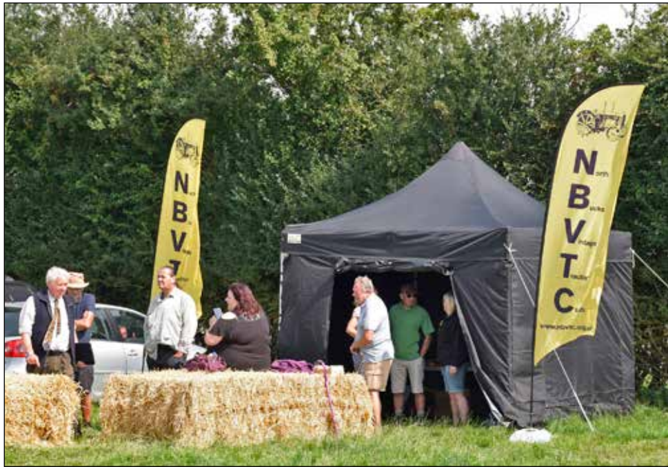
The NBVTC stand at the show was well visited by every passerby