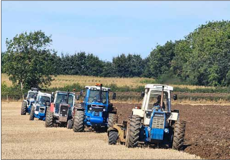
How did that red one get in there?!