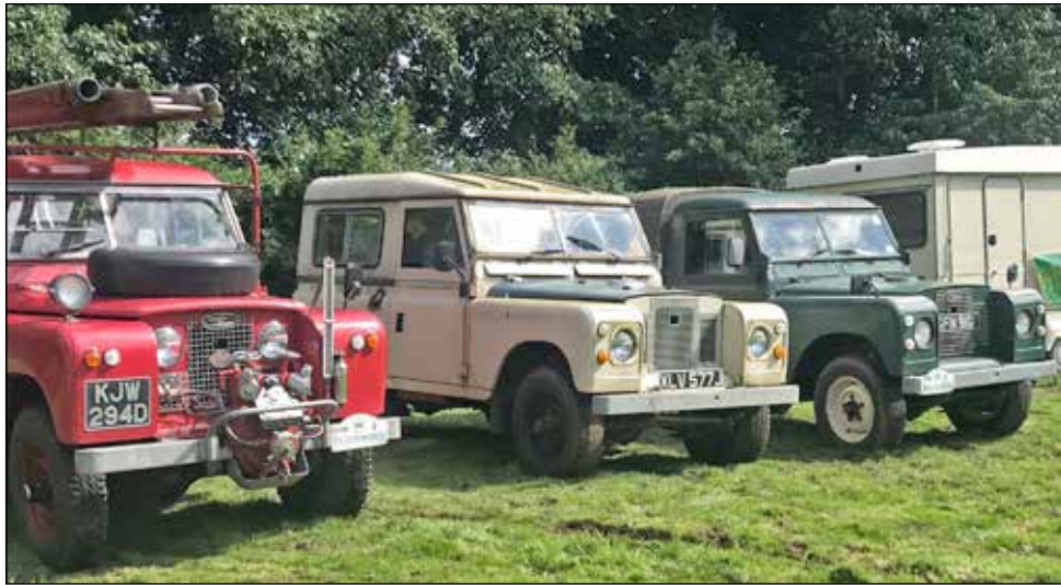
Series 2 Club Event