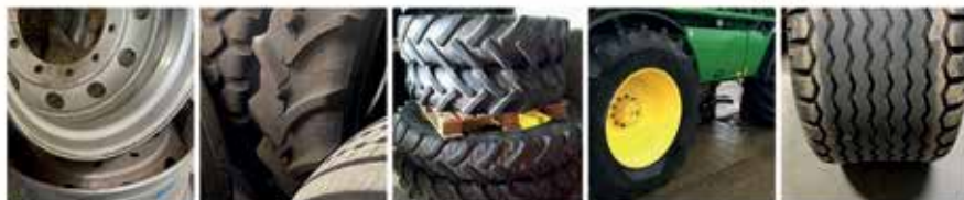
NEW AND USED RIMS