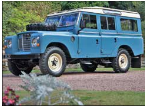
Series 3 LWB Station Wagon

everyone in wide awake suits calling me 'sir' & a choice of 10 different types of coffee from a fancy machine, polished surfaces & glossy brochures everywhere but total incompetence when it came to fixing my car. On one occasion, having limped to the dealership from Surrey with an overheating problem and parked it outside I was told that under the warranty to be entitled to a courtesy car to get home I would need to drive around until it broke down, and wait for it to be recovered and taken to the dealership where it was currently parked! Needless to say I refused until they gave me a loan vehicle. Give me a mechanic in greasy overalls with an oily rag and spanner in his pocket any day! After 120,000 miles LR would no longer extend the warranty, it was using water at an alarming rate and had to go.