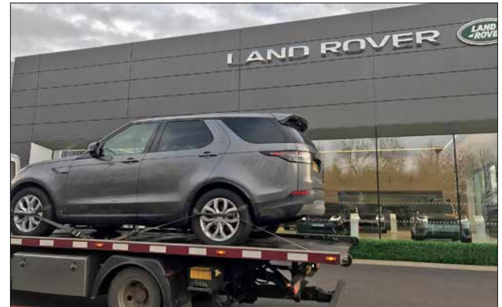
Discovery 5's Second Home!

Although most of its problems were eventually sorted under the warranty the dealer in MK was totally incompetent when it came to repairs. The garage was a typical modern dealership with