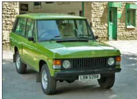
1980's Range Rover

Modern Land Rovers are now so expensive to buy, run and maintain and I've seen no proof that the reliability or customer service has improved so I've switched to a Ford Ranger pickup. Despite the problems I've experienced, Land Rover is a fantastic brand with millions of loyal customers.