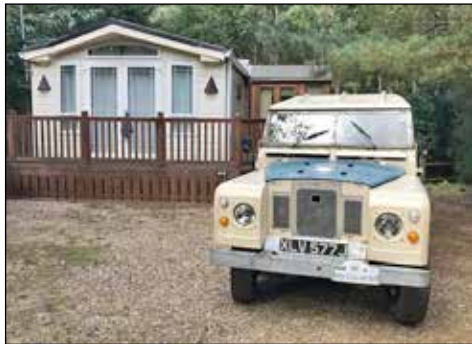
At Kelling Heath, Norfolk

Being a huge fan of farming, tractors & all things rural I suppose it's only natural that I should also be passionate about Land Rovers – the original farmers vehicle.