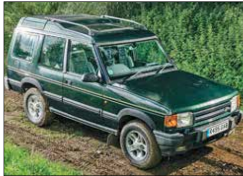
Discovery Mark 1