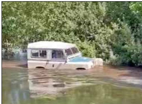
Fording at Sculthorpe Mill, Norfolk