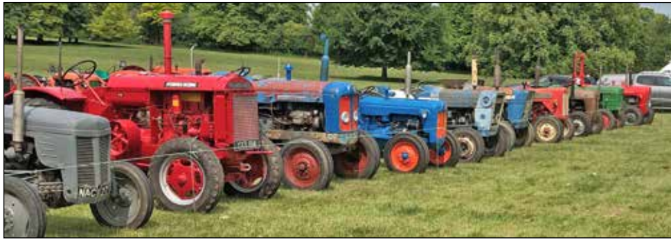
More Photos of The Bucks YFC County Show