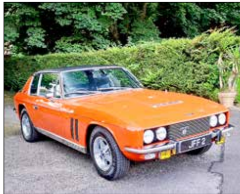
The world's first 4WD car the Jensen Interceptor