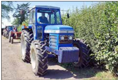
Leyland 285 synchro 4WD on the BVTC road run