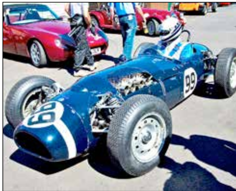
P99 Racing car driven by Sir Sterling Moss in 1961

Later Harry Ferguson's 4WD System was used in a collaboration between Jensen Motors and Harry Ferguson. They launched the Jensen Interceptor using his FF Ferguson Formula, which produced the world's first four-wheel drive and anti-lock brake car. Unfortunately, it was not a commercial success.