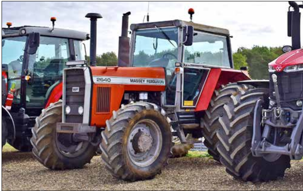
Massey Ferguson 2640