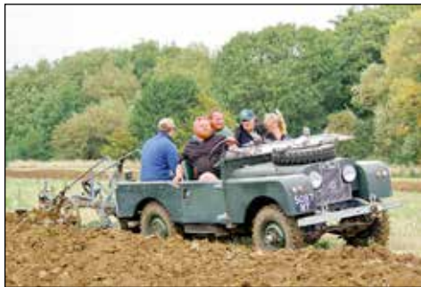
Landrover and trailed plough also at Haynes