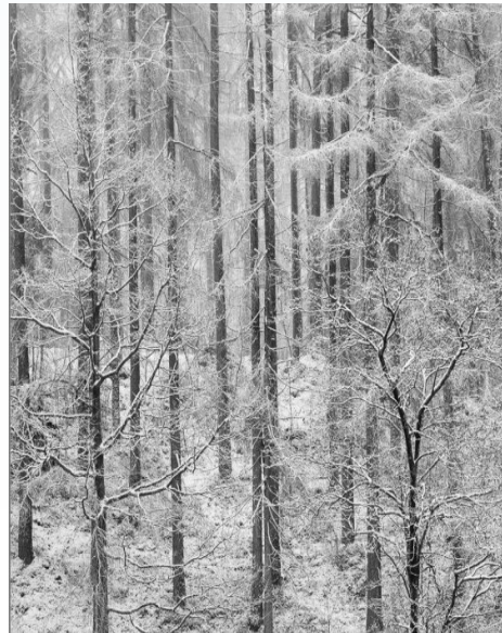
Jon Watkins: 'A Congress of Ghostly Stripes'