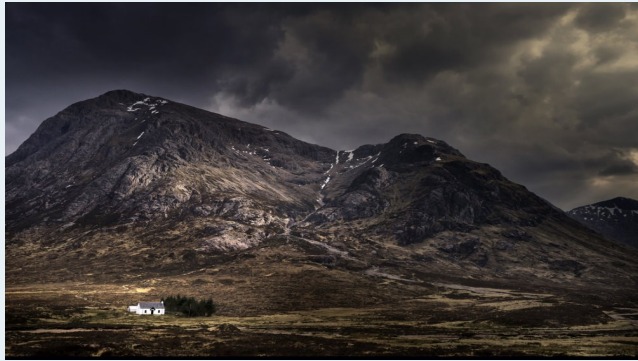
Simon Shore: 'Storm Over Glencoe'